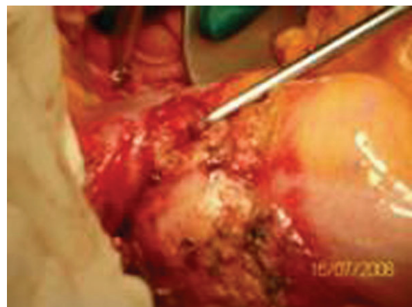
Figure 2 Duodenal neoplastic involvement