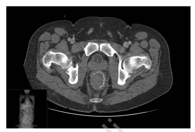
Fig. 1 - CT scan shows the staple line along the wall of the rectum.

hemorrhoid pathology is often underestimated and considerated like simple surgery, not considering and accepting probable complications;