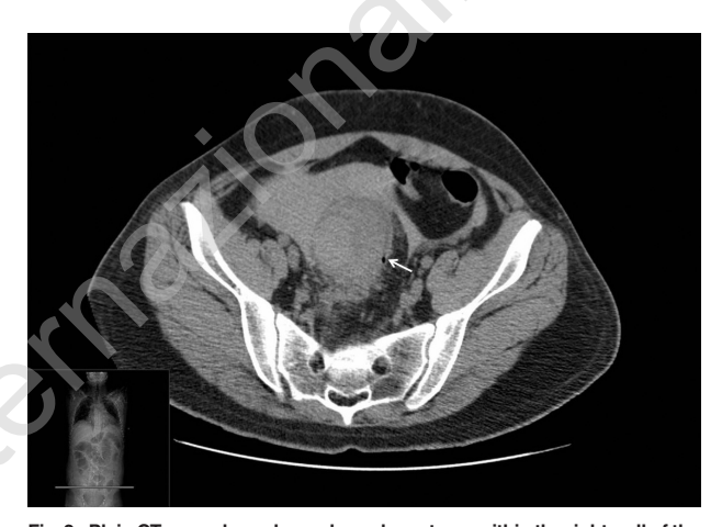
Fig. 2 - Plain CT scan shows hyperdense hematoma within the right wall of the rectum. Note small. gas bubble within the left wall of the rectum (arrow) . Hemoperitoneum is also present.